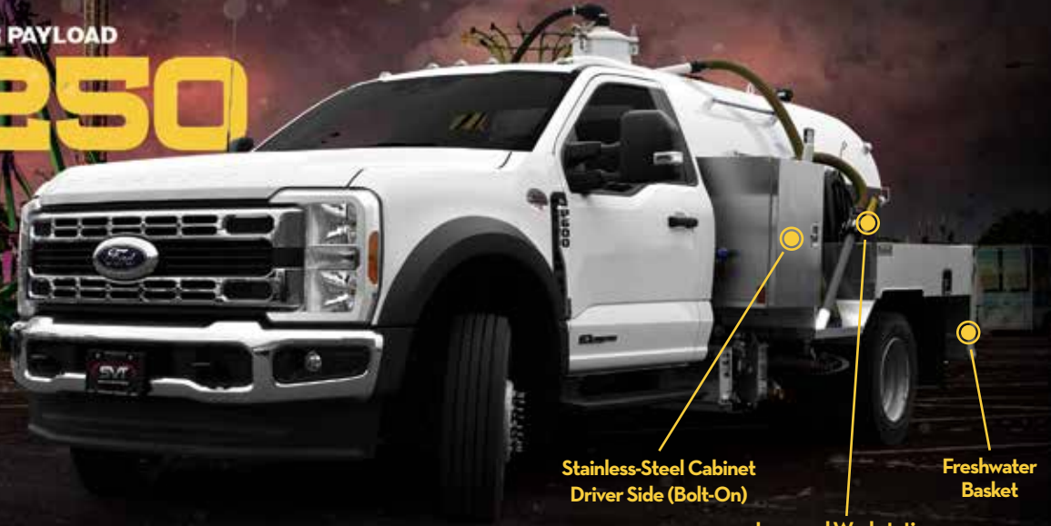
Stainless-Steel Cabinet Driver Side (Bolt-On)