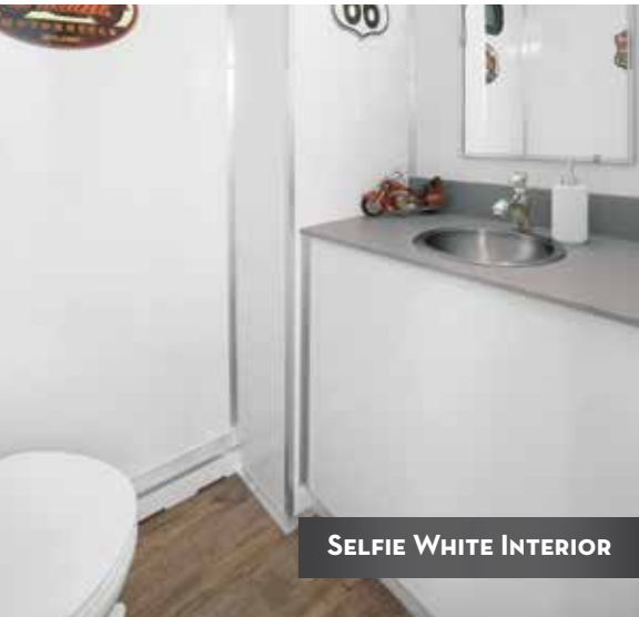
SELFIE WHITE INTERIOR

NO. OF STATIONS - 2 APPROX. NO. OF USES - 525 FRESHWATER - 94 GAL WASTEWATER - 132 GAL WEIGHT - 3,300 LBS WHEELS - 14" ALUMINUM AXLE - 3,500 LB TORSION