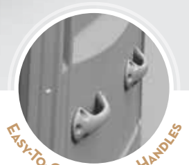
EASY-TO-GRASP LARGE HANDLES