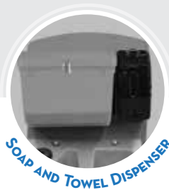
SOAP AND TOWEL DISPENSER