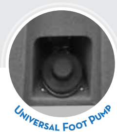
UNIVERSAL FOOT PUMP