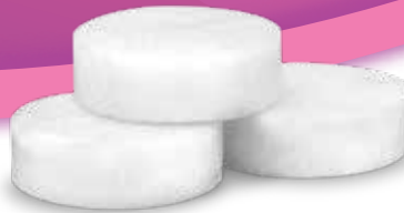
MASK STRONG ODORS